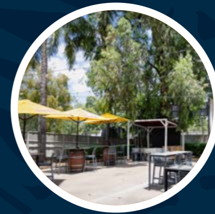
The Beer Garden