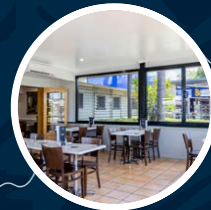
The Front Room